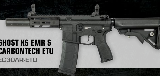
GHOST XS EMR S CARBONTECH ETU EC30AR-ETU