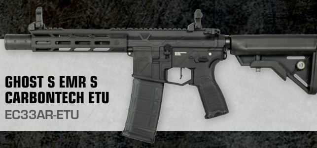
GHOST S EMR S CARBONTECH ETU EC33AR-ETU