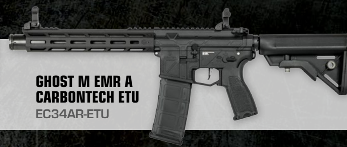
GHOST M EMR A CARBONTECH ETU EC34AR-ETU