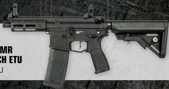
GHOST XS EMR CARBONTECH ETU EC28AR-ETU