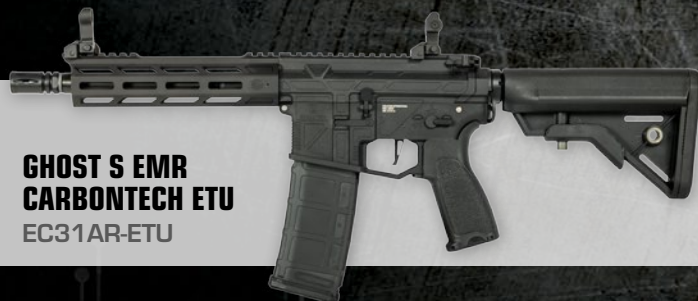
GHOST S EMR CARBONTECH ETU EC31AR-ETU