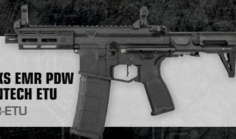
GHOST XS EMR PDW CARBONTECH ETU EC36AR-ETU