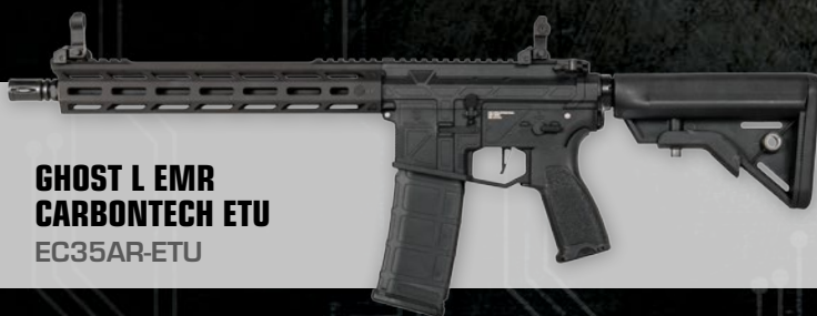
GHOST L EMR CARBONTECH ETU EC35AR-ETU