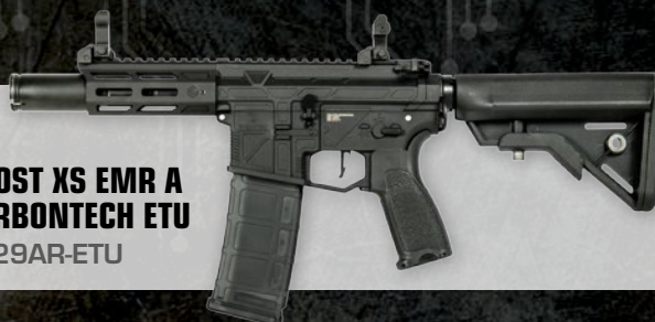
GHOST XS EMR A CARBONTECH ETU EC29AR-ETU